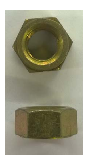
AN315-6R (Incorrect Part)