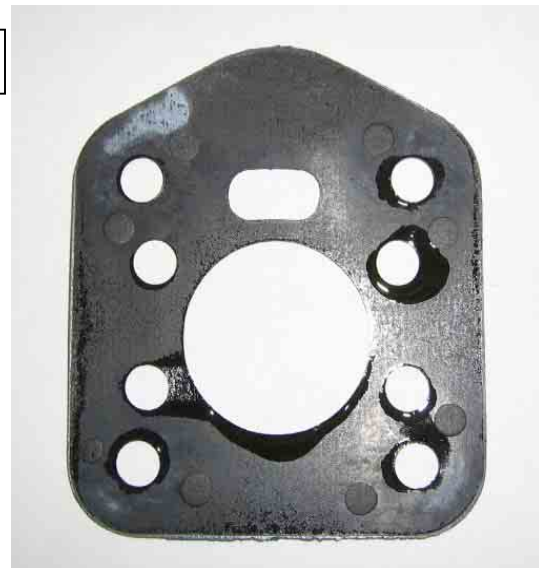
Photo 2- Prop Governor Gasket (Lycoming Shipping Gasket) MUST BE REMOVED

Note: Both gaskets are dark gray in color. The governor base gasket is easily distinguished with a filter screen.